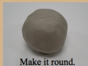
Make it round.