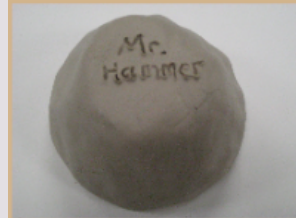
Sign your name.