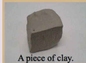
A piece of clay.