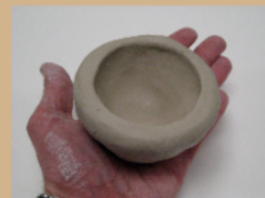
You did it!