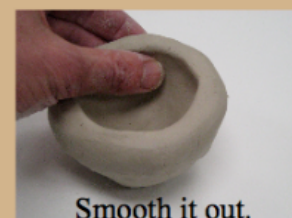
Smooth it out.