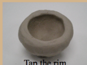
Tap the rim.