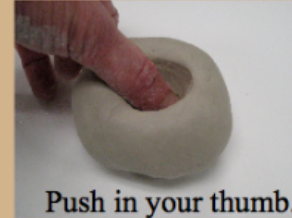
Push in your thumb.