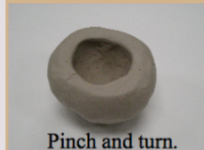
Pinch and turn.